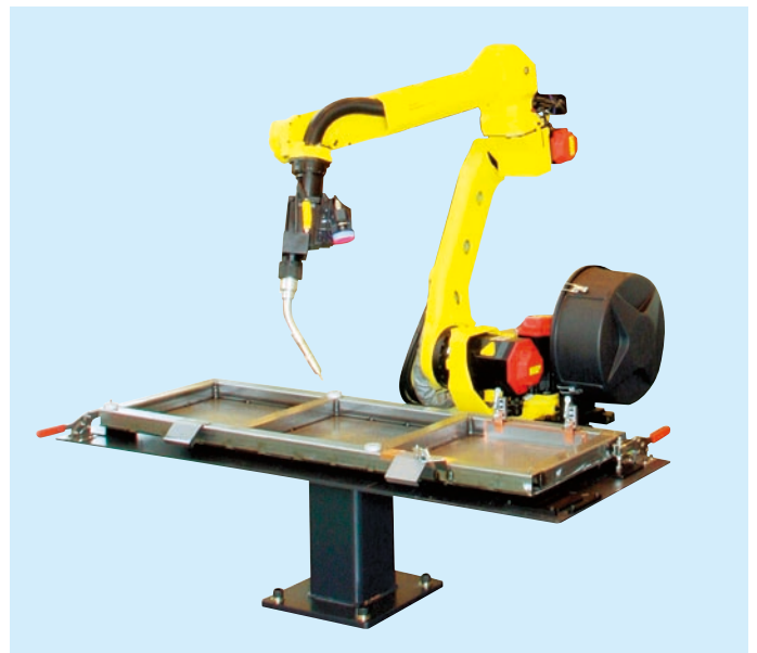
Architectural part arc welding with i RVision