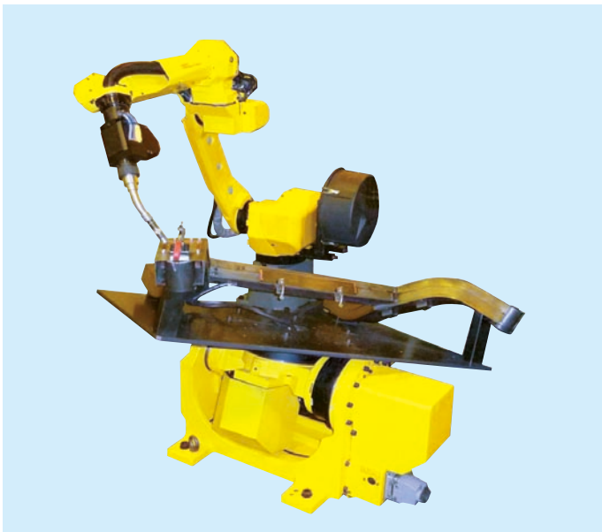
Automobile part arc welding with Servo Torch