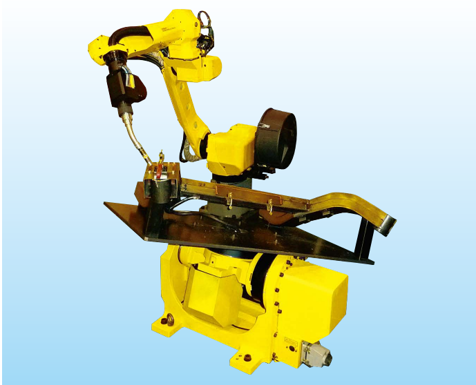
Automobile part arc welding with Servo Torch