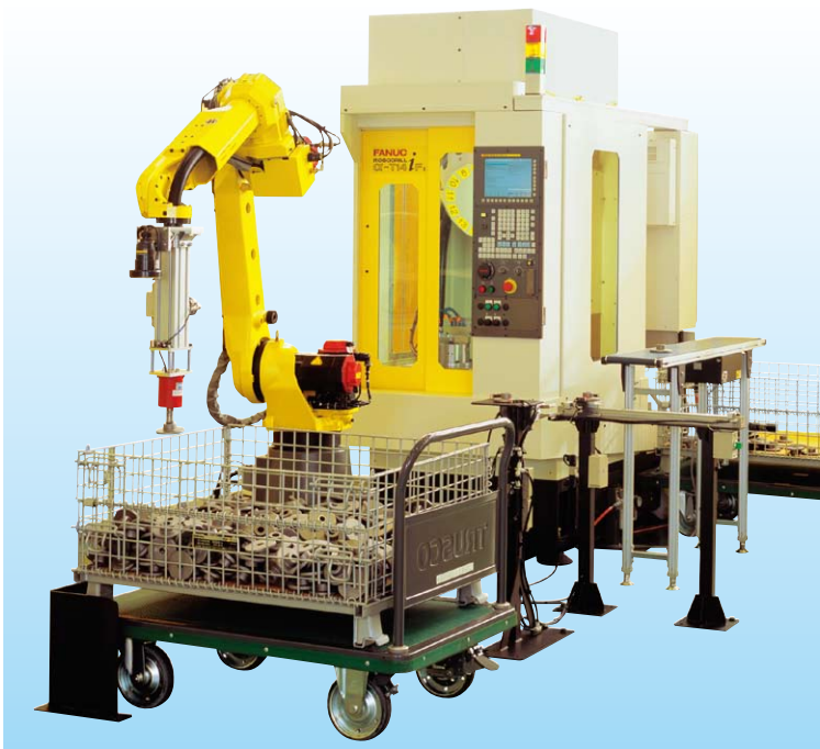
Small parts bin picking