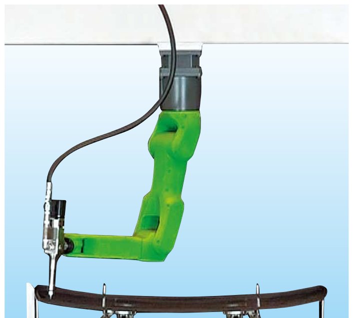
Apply Adhesive to Windshield (Up-side Down)